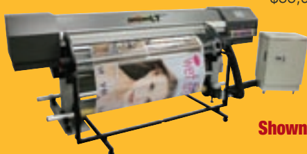
Shown with optional CAPTIVAIR Air Quality System

Reach your production goals quickly with Mutoh's Toucan LT! Save time and money with the only outdoor printer in it's class capable of true unattended, overnight printing. Increase production and profits by tackling large jobs overnight, leaving business hours free for more hands-on applications. Equipped with a heavy-duty feed system, the Toucan LT is designed to accommodate 220lbs. of media, even during unattended print runs. The Toucan LT is available in Eco-Solvent Plus ink or LT Solvent ink which ensures bright, vivid colors and up to three years' outdoor durability on every print. With print speeds up to 398 square feet per hour and resolutions up to 1440dpi, the new Toucan LT has the performance power to accelerate productivity. When teamed with the optional Mutoh CAPTIVAIR, the Toucan LT provides an environmentally friendly atmosphere, eliminating the need for exterior ventilation. Available in 64" or 87", the Toucan LT can accommodate even the largest applications. With prices starting at $33,995, the Toucan LT is an affordable solution to meet every production goal with rapid confidence!