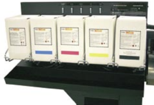
(above) SolaChrome pigmented solvent inks and Printhead Cleaning Solution in 3-liter boxes for maximum productivity.

SolaChrome inks and solvent cleaning solution come in large, no-pour, 3-liter containers that keep you printing and not filling. The ink delivery system of the DisplayMaker 72si and DisplayMaker 98si are another valuable productivity feature for non-stop printing.